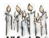
All Souls Day

The month of November is especially dedicated to Holy Souls and November 2 is the Feast of All Souls. For those who die repentant, but have not made up for their sins or purified their hearts, the Church believes in a state of purification after death called purgatory (from a word meaning 'purify'). Even though the names developed only in the 14 th century, Christians from the beginning manifested their faith in this state of purification praying for those who had died.