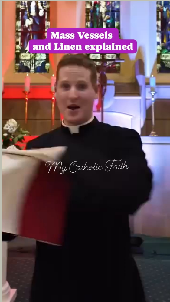
My Catholic Faith Videos, Facebook Mass vessels and linen explained